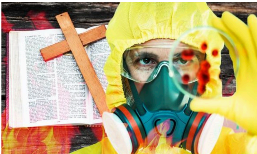
Coronavirus: The deadly disease has links to the Bible, people have claimed online (Image: GETTY)

READ MORE: END OF THE WORLD: Why coronavirus is only the tip of the iceberg