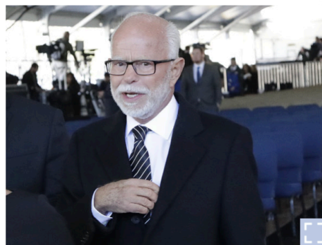
Televangelist Jim Bakker, shown here in 2018, faces a legal challenge from the state of Missouri for selling a false remedy against the coronavirus. The COVID-19 disease currently has no cure.