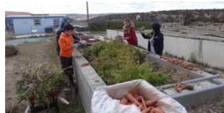
Learning to pull carrots and prepare gardens for winter