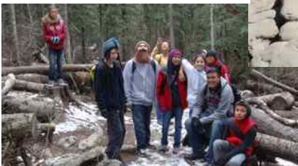
Sandia Mountain Peak Yes that is snow!