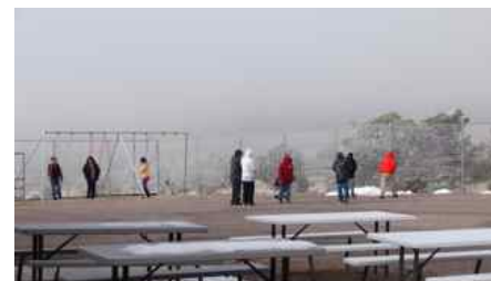
Strange icy fog descends on Black Hat.