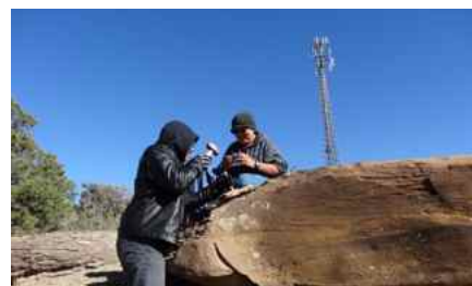
Fossil hunting in our back yard - the kids found many!