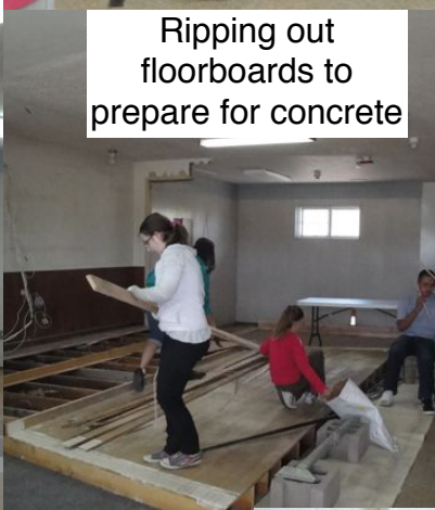
Ripping out floorboards to prepare for concrete