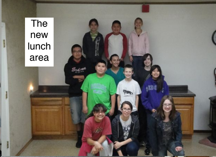
The new lunch area