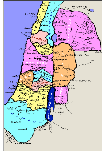
Boundaries of the Tribes of Israel