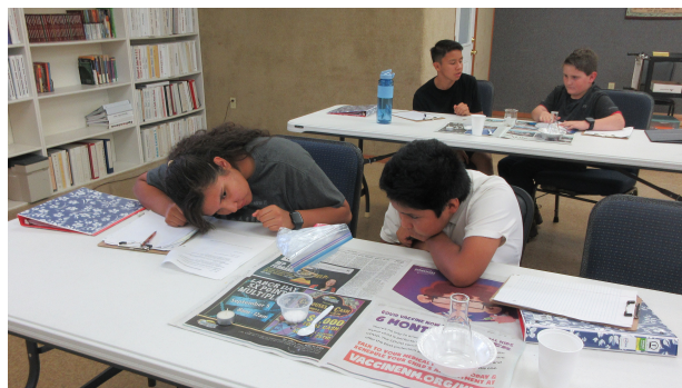
Science - States of matter and chemistry experiments