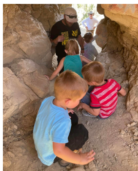
Exploring the cliffs