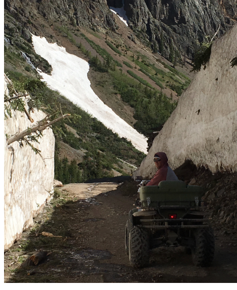
One road in CO that has 100 foot deep avalanche about 1/4 mile away from this spot. They may not get this road open this year.

Kason on the left and Collin on the right. Look at the blue, blue eyes on Collin!