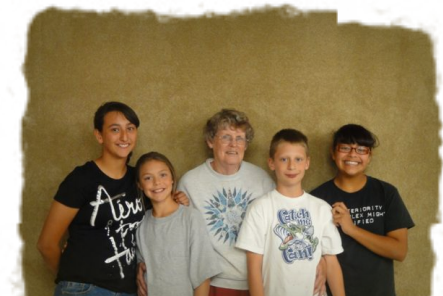
Grammy with Great-Grandchildren