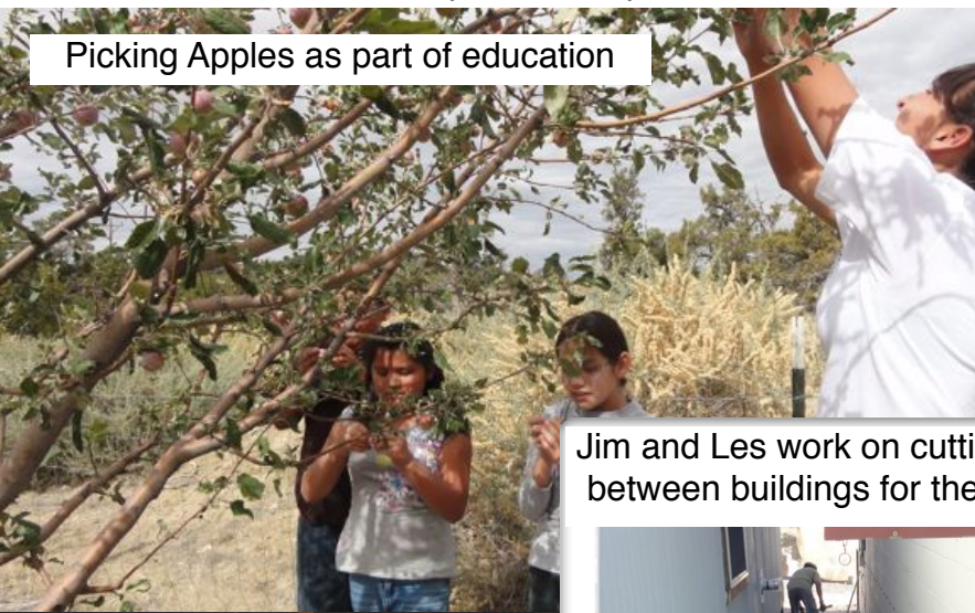
Picking Apples as part of education